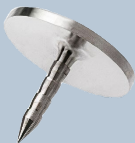
Hemorrhage Occluder Pin

Shackelford's Surgery of the Alimentary Tract 1